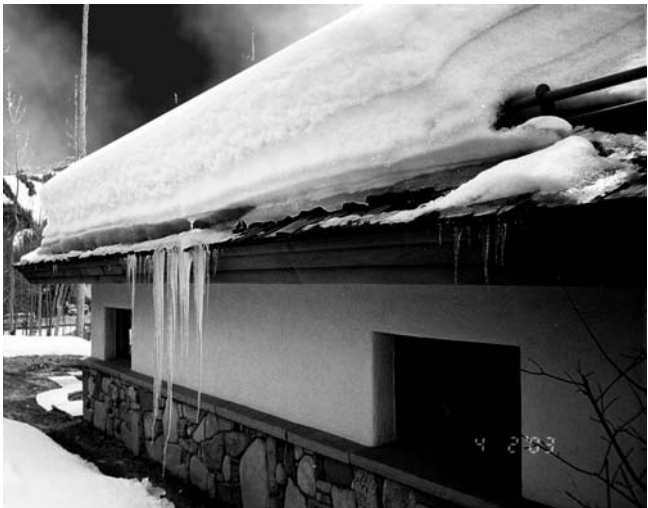
Photo of Typical Ice Dam