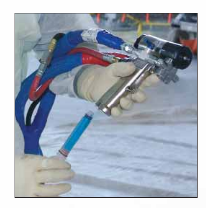
Each cartridge contains about 1,500 trigger shots (pulls) a day, allowing you to work through one to two kits.